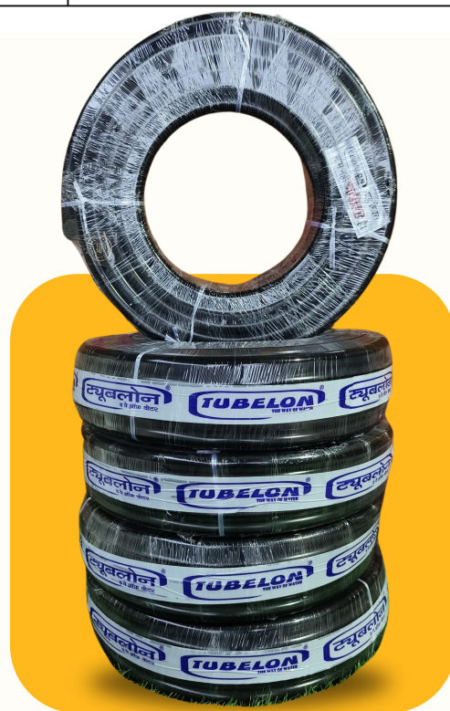
Weight Chart For Black Unbreakable Hose:

If we talk in the true sense, our expertise in PVC material starts from here. TUBELON as a brand prides itself on such articles. In it, we have developed this UNBREAKABLE BLACK HOSE from one of our secret formulas. We use unbreakable black material in manufacturing this pipe. It is suitable for commercial construction, outdoor water applications, and boring water pressure applications. Below is the weight chart and photo of this pipe.