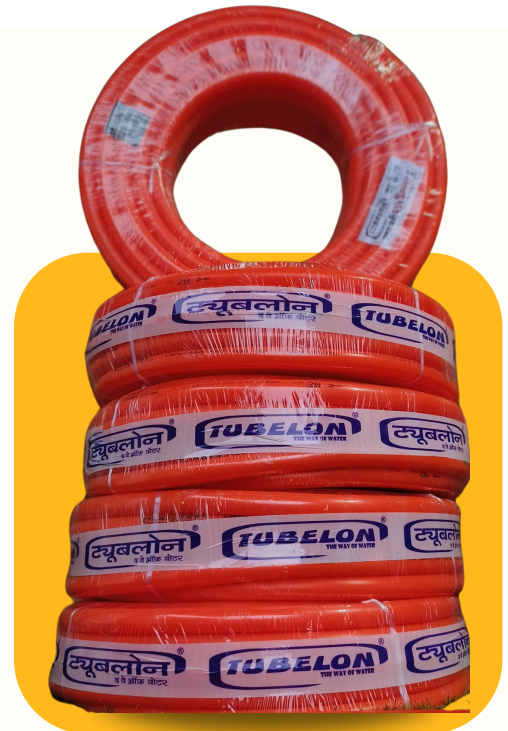
Weight Chart for Saffron Gold Foam Pipe:

This pipe is a different type of pipe with a different look and feel to the pipe. The specialty of this pipe is that this pipe feels very velvety in hand and its smooth finish and disco properties make it a lot of fun to use. The material of this pipe comes to us in saffron color, so we have given the name of this pipe as Saffron Foam Imported Material Garden Hose. In this pipe, the chances of pipe twisting, kinking, tightening or cracking are negligible. This pipe is recommended for domestic water use. Below is the weight chart and photo of this pipe.