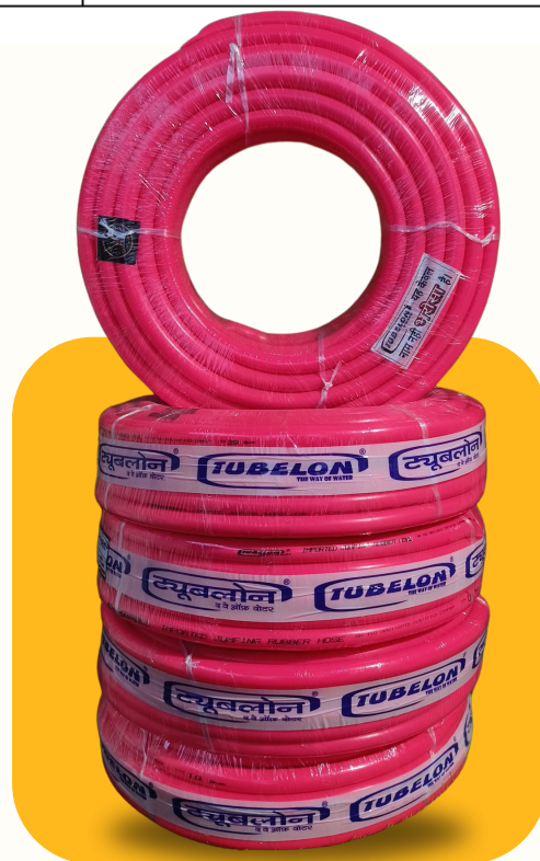
Weight Chart for Mulmul Rubber Hose:

In this pipe we use a material that looks like rubber, this material is usually soft and flexible. One of the properties of this material is that its outer surface feels like mulmul when handled. Hence it is called mulmul pipe because of that property. This pipe is advisable for use in cold regions, and where pipe jumps are required. Below is the weight chart and photo of this pipe.